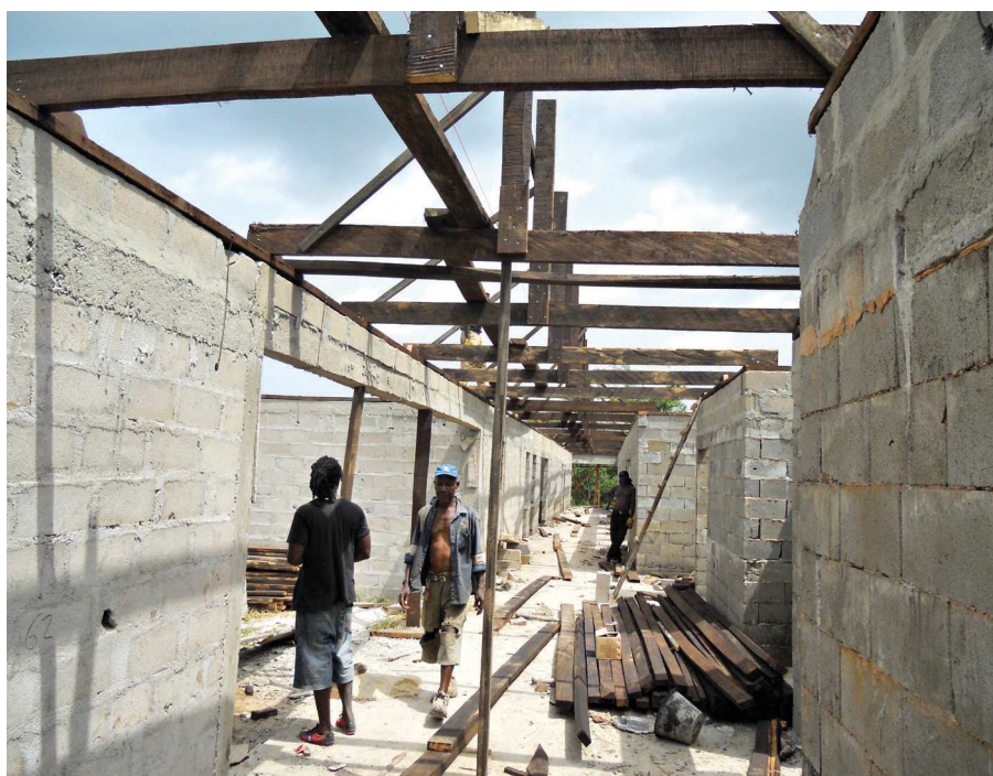
5789 MILE MISSION: Progress on the New Hope Academy in Liberia.

About seven years ago, Power From The SON was formed to engineer, procure, and construct efficient electrical systems for hospitals, schools, and missions in the developing world. In that time, our members have journeyed to Liberia five times and have had a small part in saving the lives of many faceless Liberians through a war-torn hospital where the doctors previously operated on patients without the use of anesthesia machines. We have electrified a seminary where future United Methodist ministers learn to preach the gospel to future generations. This